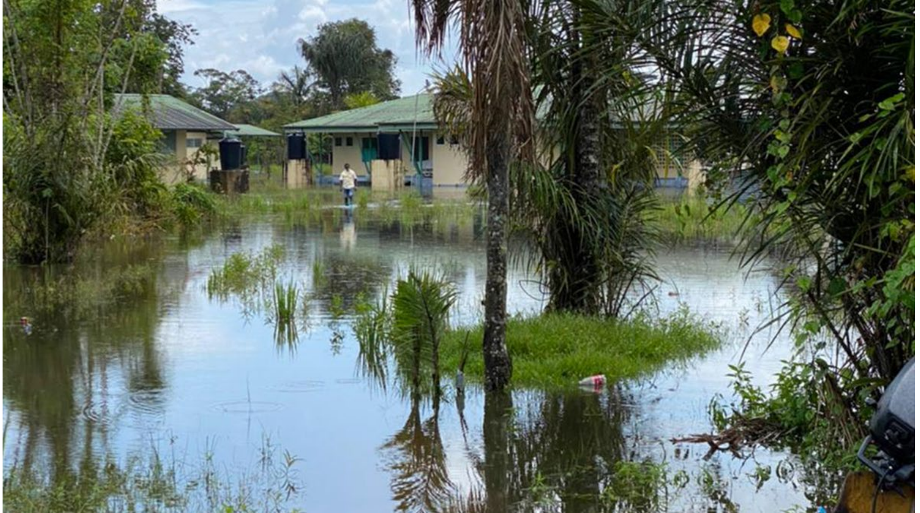
Flooding around health clinic making access difficult