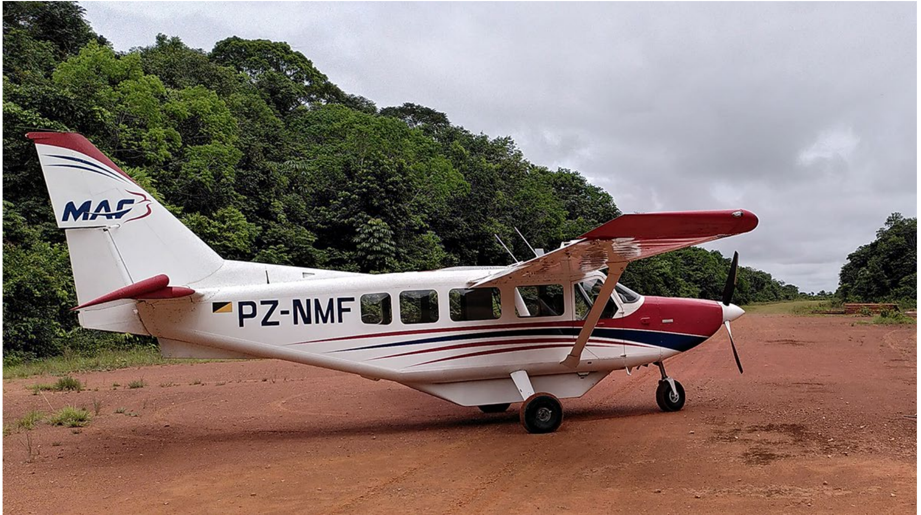
MAF aircraft at remote Amatopo airstrip