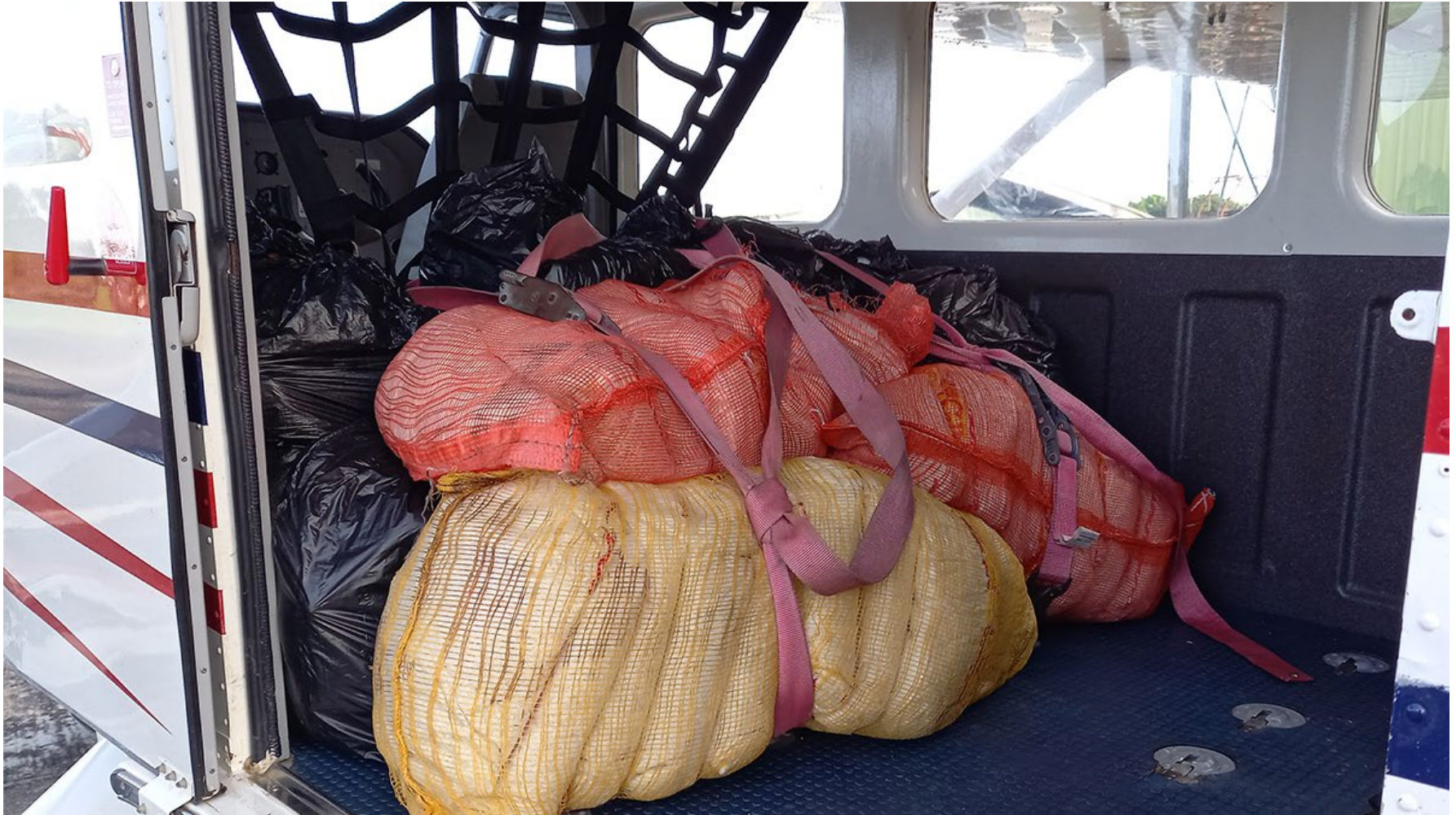
Food on MAF aircraft destined for southern Suriname