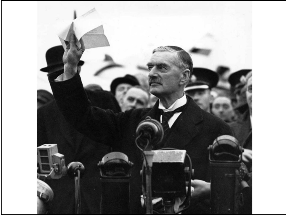
Autumn 1938 – “Peace for our time”